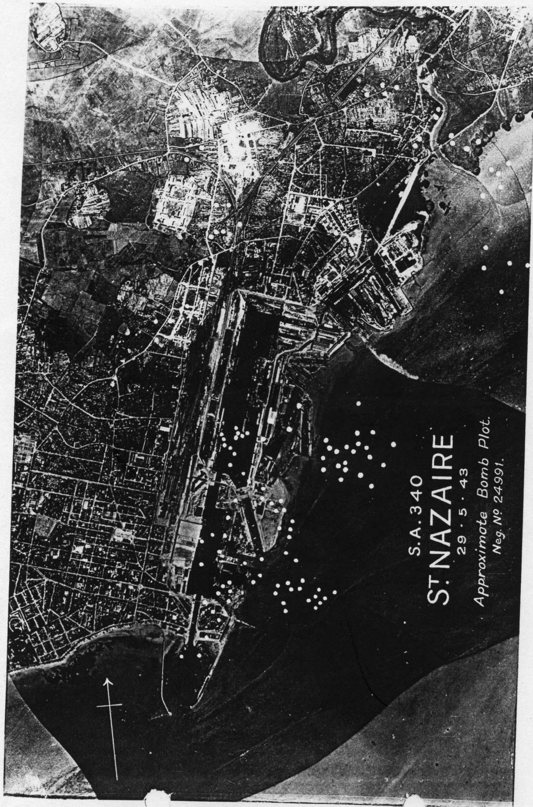
S.A. 340 ST. NAZAIRE 29. 5. 43 Approximate Bomb Plot.